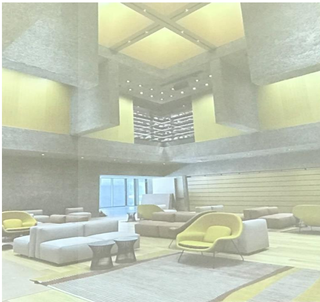
Princeton University Art Museum