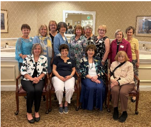
The 2026-2027 Board