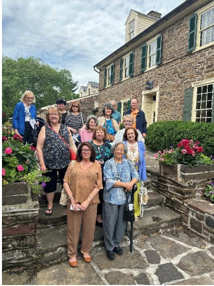
Pearl S. Buck House Tour