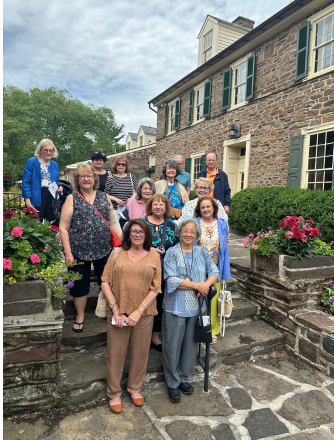
June 18, 2026 trip to The Pearl S. Buck National Historic Landmark at Perkasio in Buck County, PA