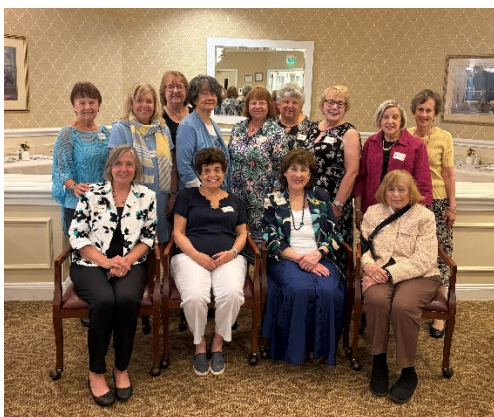
The 2026-2027 Board